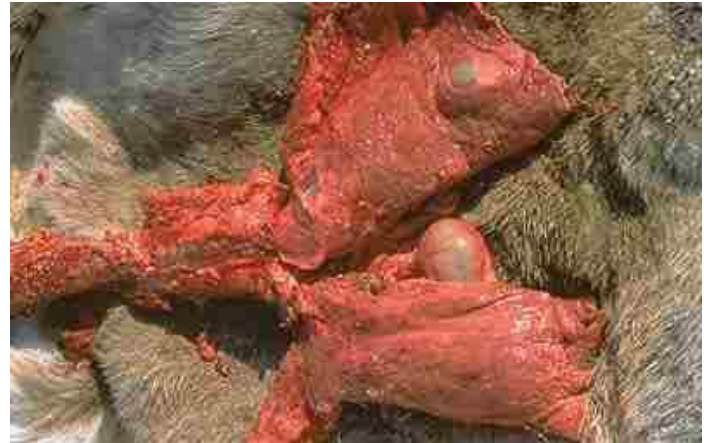
Two hydatid cysts in moose lungs displayed on moose hide.

Throughout Alaska and most of Canada, these cysts are found in moose and some caribou wherever wolves are present. In Alaska, over 300 cases of echinococcosis (hydatid disease) in humans have been reported since 1950 and both Alaska and Canadian F&G agencies publish warnings urging trappers and hunters to wear rubber gloves and protective clothing when skinning or handling a wolf carcass.