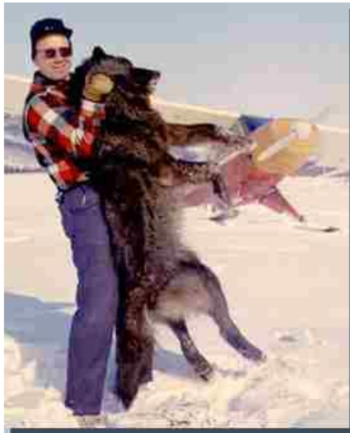
Photo by Leroy Shebal of black wolf taken using ski-equipped Piper Super Cub.

Coyne’s article describes a scene from a movie produced in 1967 by well-known Alaska Master Guide and bush pilot Leroy Shebal in which a gray wolf was apparently missed by an aerial hunter with the first shot, wounded with the second and killed with the third. Although the film received rave reviews when it was shown all over the U.S. in 1969-71, wolf advocates now denounce it as an example of “inhumane” wolf control.