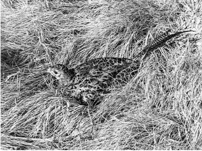
Well-camouflaged hen pheasant in tall grass. Each additional hen that survives the winter increases the odds of better hunting.

But when a severe winter takes a heavy toll on pheasants, conservation management dictates preserving a viable population rather than exploiting adult males. If more males are allowed to survive until winter, fewer productive females will be taken by predators during the winter.