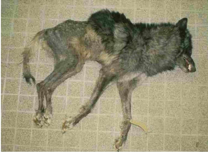
Gray wolf that died as a result of sarcoptic mange.

Sarcoptic mange has been confirmed by testing in three wolf packs just east of Yellowstone Park and in one northwest of the Park in Montana. All wolves that are captured for collaring or other reasons are reportedly being injected with Ivermectin in the hope it might help the healthier animals fight off the infection.