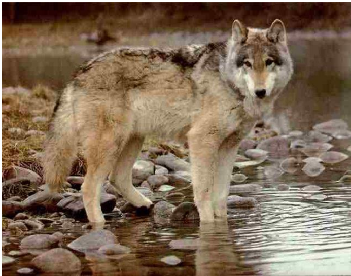
Gray wolf in Yellowstone National Park. Adult males brought from Canada averaged 111 pounds, females 94 pounds.

From 1906-1927, the reported take of large predators from Yellowstone National Park was 127 wolves, 134 mountain lions and 4,352 coyotes. This resulted in speculation that as wolf numbers decreased the number of coyotes increased.