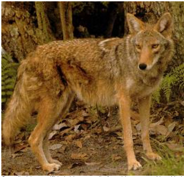
So-called "coywolf" hybrid reportedly found in western New York, Western Pennsylvania and elsewhere. It resembles the western coyote in appearance except for being much larger, but displays wolf traits including pursuing larger prey and hunting in packs

trade in endangered species) has matured. Activist judges who are willing to ignore the massive damage inflicted on an increasing number of U.S. citizens by wolf recovery – and ignore the fact that the former wolf subspecies are being replaced with assorted mongrels – are using ESA language to halt or overturn delisting.