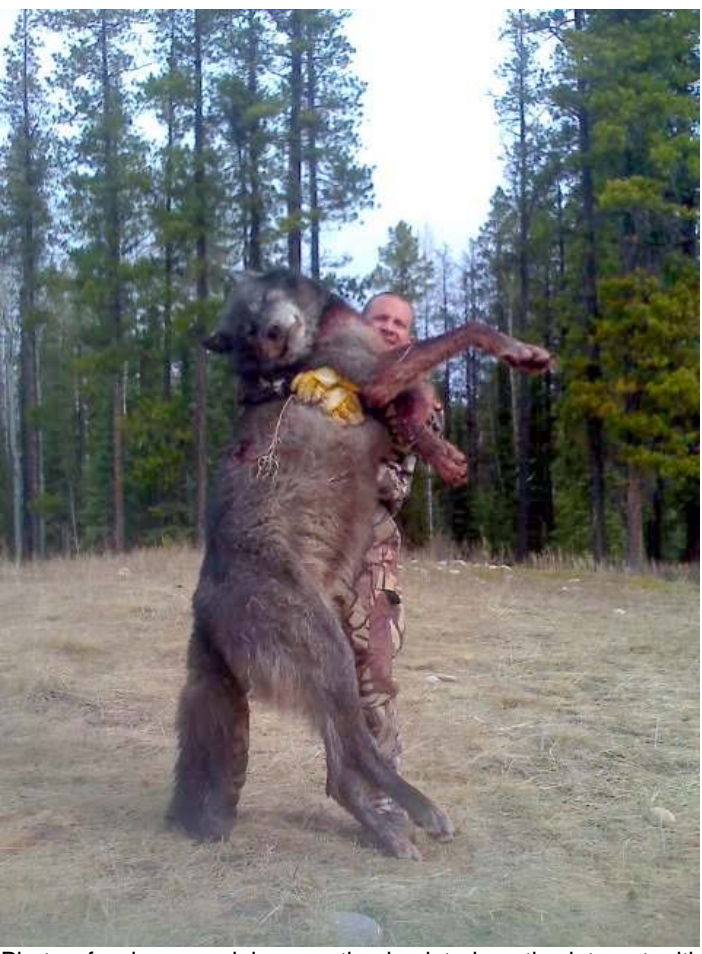
Photo of unknown origin recently circulated on the internet with the claim that the wolf was shot due to his continued killing of livestock in Sun Valley, Idaho. (Note frayed snare cable - ED).

This expensive activity undoubtedly reduced, but did not eliminate, predation on sheep by the Phantom Hill pack and was touted by the pro-wolf urban media as a "sensible" solution. But at the end of the season one rancher said it had created other problems, including stress and weight loss, and did not solve killing by other uncollared wolf packs or individual wolves.