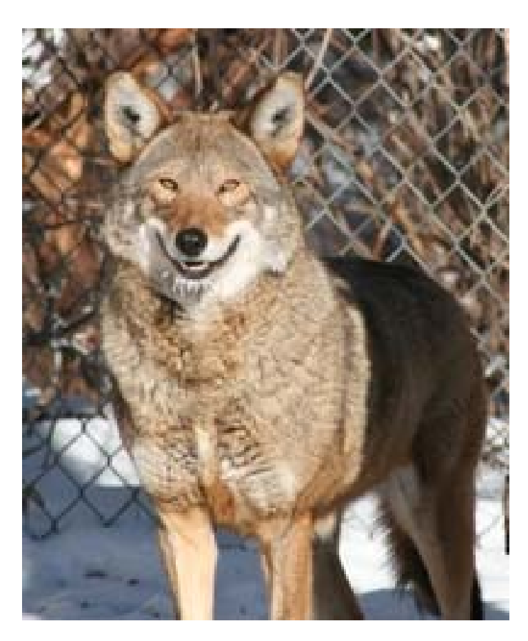
Molecular genetics analysis concluded that the red wolf being bred and raised in captivity and then released into the wild in the Southeastern U.S. by FWS is a wolf-coyote hybrid.

Two of the four wolf recovery programs in the lower 48 states depend on wolf-coyote or reportedly even wolf-dog hybrids that are raised in captivity and then released in the wild. Yet Defenders of Wildlife refused to pay an extensive livestock depredation claim in Montana because genetic testing of the wolf that was killed by Wildlife Services indicated it was a wolf-dog hybrid.