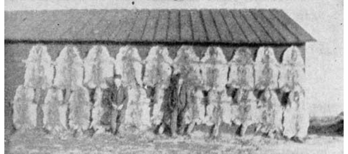
One of Wolf Trapping Photos in Book, Titled “A Good Catch”

Although Wyoming reportedly increased its wolf bounty payment to $5.00 before 1909, it remained one of the lowest wolf bounties paid by any state or province. Yet in the ten years preceding 1909, Wyoming paid State bounties of over $65,000 on wolves alone, and $160,156 on wolves, coyotes and mountain lions together,