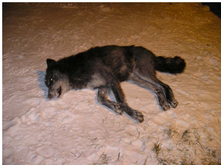
The lead wolf in the chase after the children was later killed as it moved into the camp area.

With their wives and children settled safely in the camp, the two men drove their ATVs to the shop about 400 yards distant to put them away. As they were returning they spotted the lead wolf moving close to camp and Keays shot and killed it.