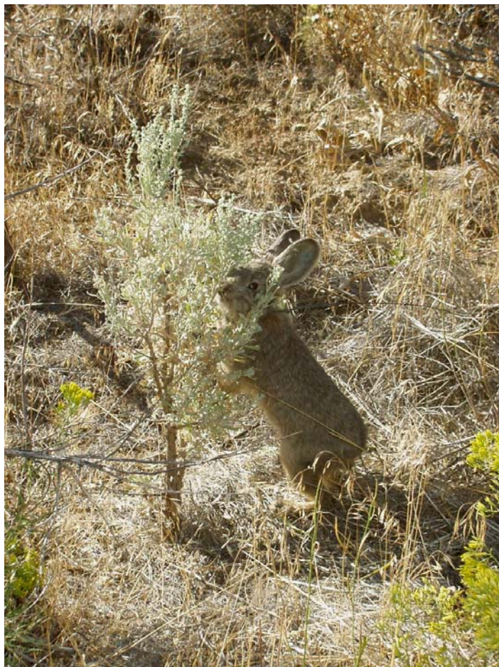
Pygmy rabbit, born and raised in captivity, just released in the wild. Radio antenna extending horizontally from neck collar is barely visible.

"Mammalian and avian predators may be a threat to pygmy rabbit populations because of the small number of rabbits and the small extent of area they occupy. During pygmy rabbit population monitoring, notes should be taken on predator species observed (including sign) and evidence of predation on pygmy rabbits. If there are indications of regular and widespread predation on pygmy rabbits, steps should be taken to discourage predators from frequenting pygmy rabbit habitat areas. " (emphasis added)