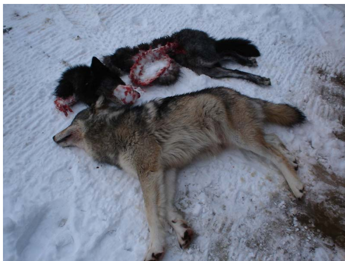
The second wolf, shown with the remains of its companion after it dragged it several hundred yards and partially devoured it, was shot the following morning.