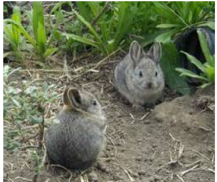
Young pygmy rabbits born in captivity for reintroduction into the wild.

Four male and three female pygmy rabbits captured in Idaho in 2000 plus their offspring had produced 30 litters totaling 90 offspring by 2003. During the same period, 16 pygmy rabbits captured in Washington had produced only nine purebred litters totaling 34 offspring, most of which died from various causes.