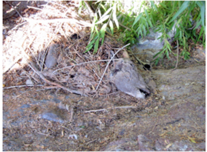
Cached bighorn sheep killed at Dripping Springs by the same collared male lion during the same period. The lion was killed on June 5 and his back trail was followed. Confirmed kills were 5 bighorn sheep, 3 deer, 1 badger and one "sheep or deer."

During that period drought was thought to impact the population yet the surviving lamb-to-ewe ratio actually increased slightly during the two worst drought years.