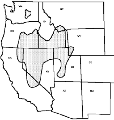
Fig. 1. Reported historical distribution of the pygmy rabbit. Only rabbits from the small area in Washington are classified as “Columbia Basin” pygmy rabbits.

In 1979 Washington Department of Fish and Wildlife (WDFW) biologists began trying to halt the decline in pygmy rabbit populations in the five counties in central Washington where they were known to exist (see figure 1). Despite the fact that the Columbia River Basin includes portions of seven Western states and two Canadian provinces, only the pygmy rabbits in Washington are called “Columbia Basin” Pygmy Rabbits.