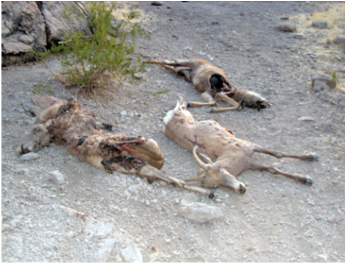
Three un-cached lion kills, two bighorn sheep and one mule deer, that were killed at Dripping Springs, near Arizona's Kofa National Wildlife Refuge, over a 3-4 day period by a single collared male mountain lion in June 2007.