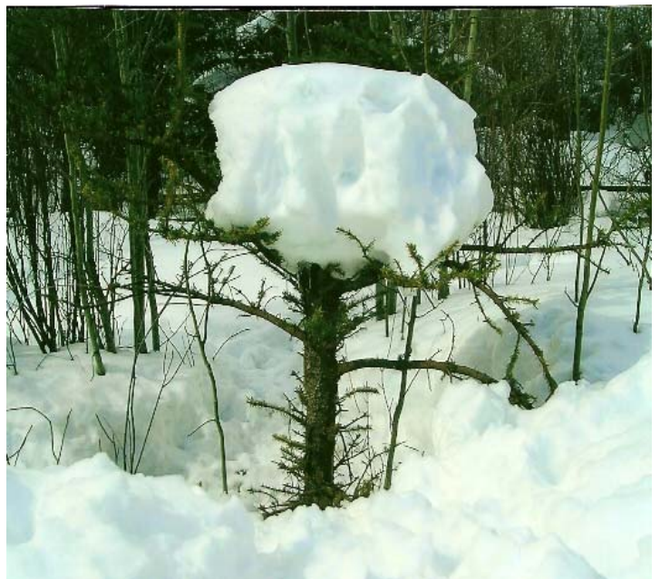
Starving deer in Montpelier Canyon stood on hind legs stripping needles and eating small branches as high as they could reach.

During the 1984 legislative session, IDFG blamed its failure to feed starving deer and elk in the Southeast Region on lack of funding. It convinced local sportsmen to