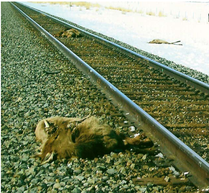
Elk were hit and killed by trains as they traveled the railroad tracks east of Montpelier searching for food.

For the first 50 years of its existence the Idaho Department of Fish and Game and its forerunner, the State Game Warden, fed starving deer and elk in critical areas during extreme winters. During extended periods when excessive snow depths on big game winter range prevent the animals from accessing forage that is normally available most of the animals will die unless they are fed.