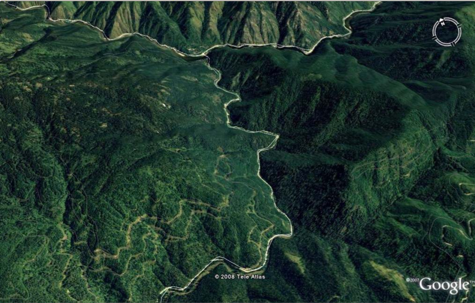
Google earth image of Orogrande Creek where it empties into the North Fork of the Clearwater river in Idaho. Note this is just one of many tributaries that enter the North Fork where elk typically winter in.