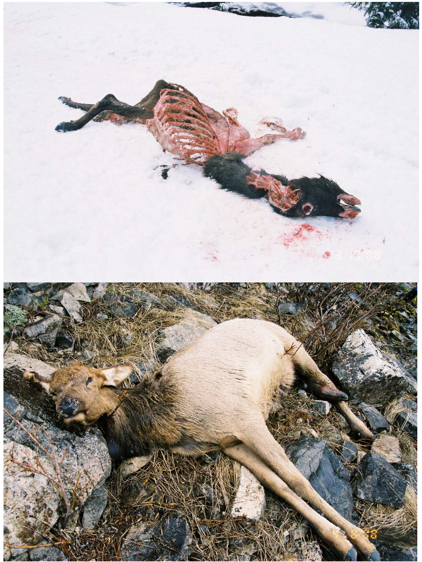
This cow had been sport killed next to the river and left uneaten. The photographer Had to walk into the river to take this photo.